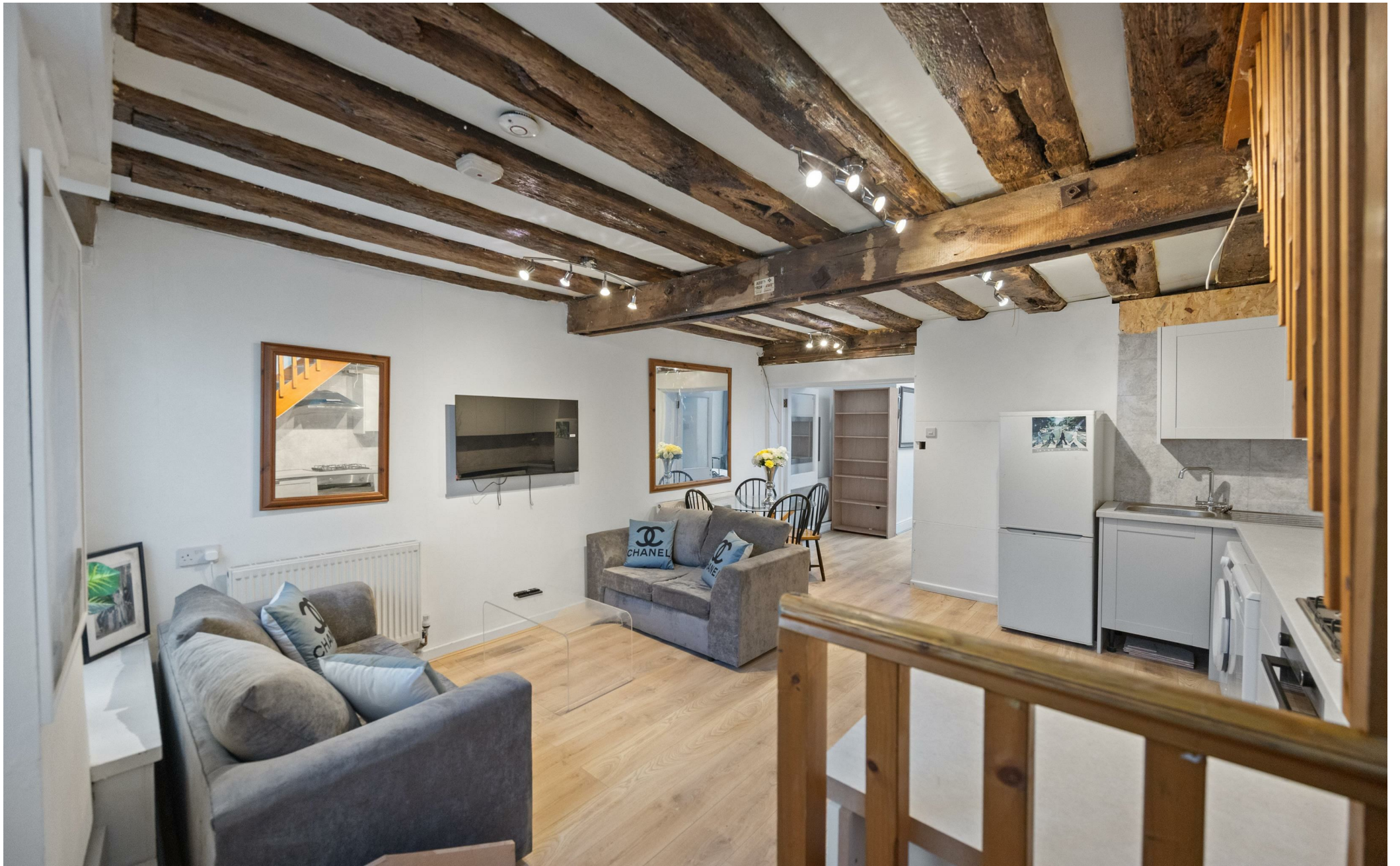
Hermit Place NW6