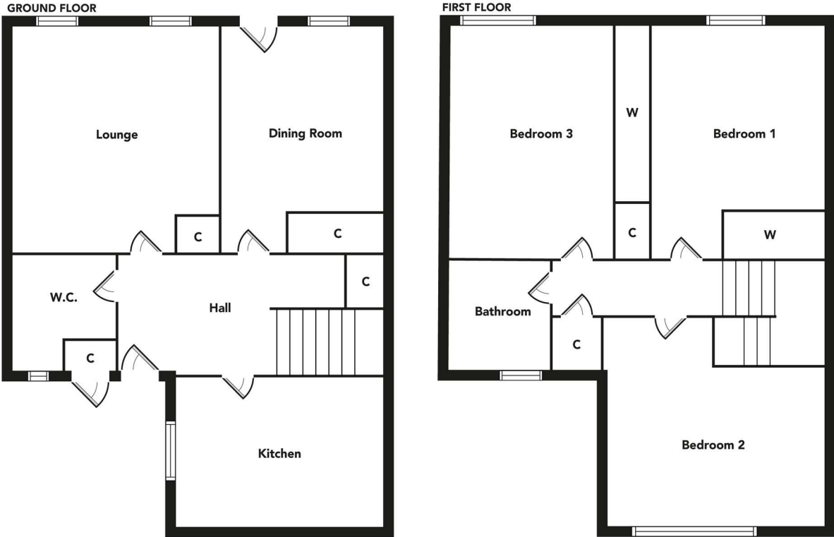
Floorplans are indicative only - not to scale Produced by Plushplans