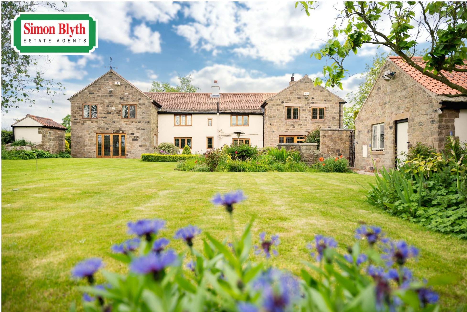
BRANTON COTTAGE, TOP LANE, DN5 7DG