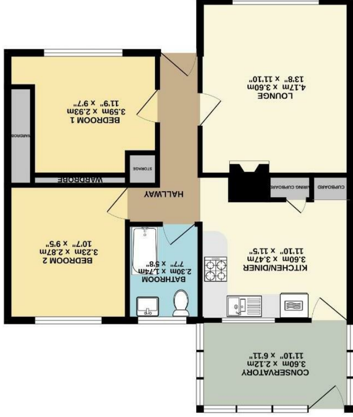
GROUND FLOOR 63.9 sq.m. (687 sq.ft.) approx.

36 High Street, Brandon, Suffolk, IP27 0AQ T: 01842 813466 E: brandon@shiresstatagents.co.uk