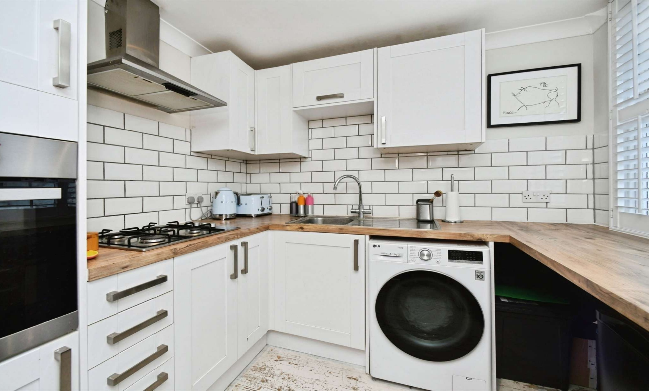
Hova Villas,Hove BN3 3DG