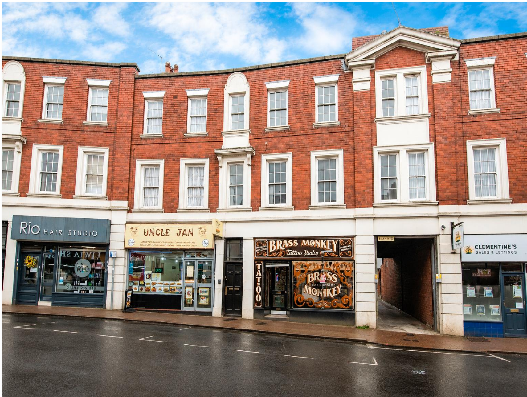
New Street, DUDLEY DY1 1LT