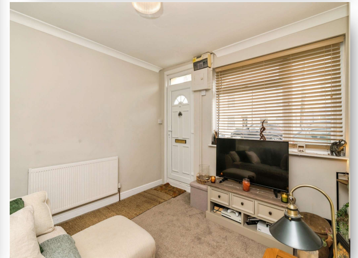
Seago Street, Lowestoft NR32 2DT