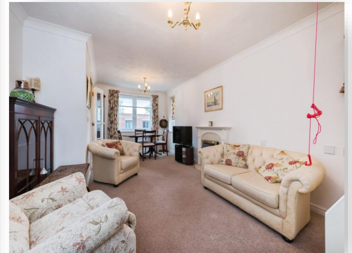
Fairholme Court, Archers Road, Eastleigh SO50 9PP