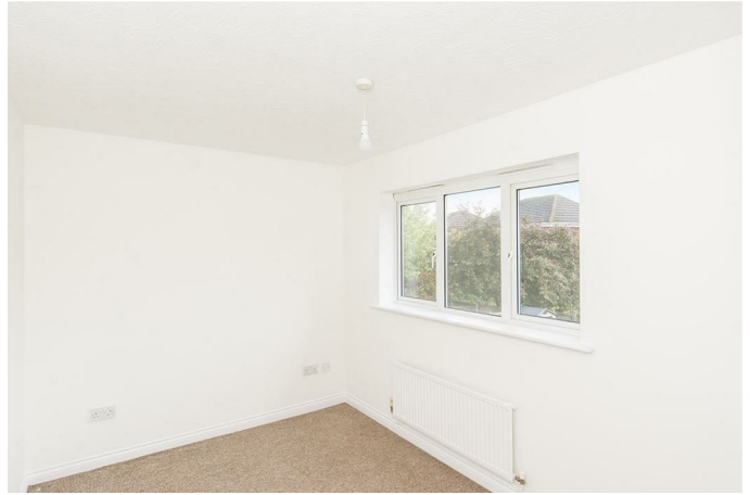
Bedroom Two 12'8" max x 7'9" max (3.86m max x 2.36m max)