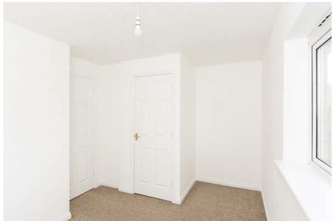
Double glazed window to the front elevation. Airing cupboard housing lagged hot water tank. Radiator.