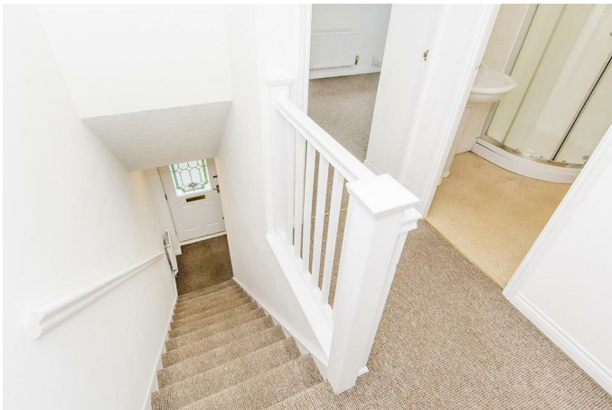
Timber balustrade. Doors to rooms.