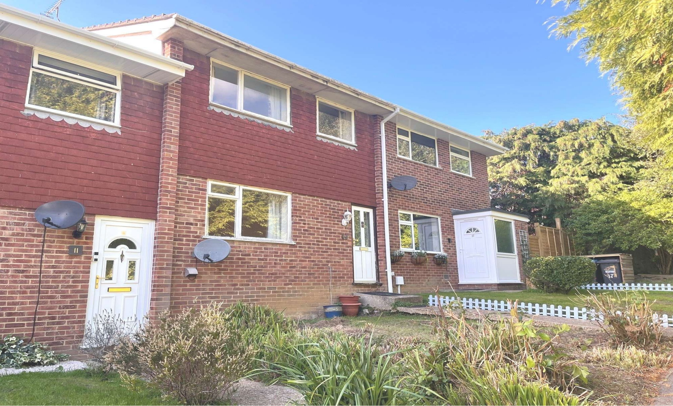
Duncton Close, Haywards Heath RH16 4DX