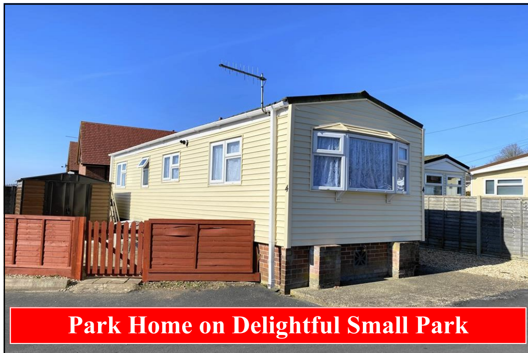
Park Home on Delightful Small Park

4 Ashley Wood Park, Tarrant Keyneston, Blandford, Dorset. DT11 9JJ