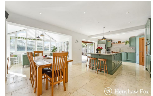
The Magnolias | £1,000,000 Stockbridge Road, Timsbury, Hampshire, SO51 0NF