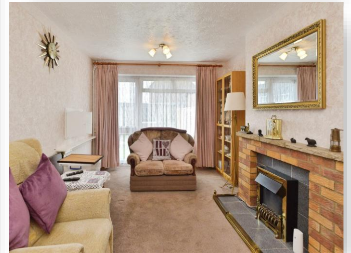
High View, Deanshanger Milton Keynes MK19 6LN