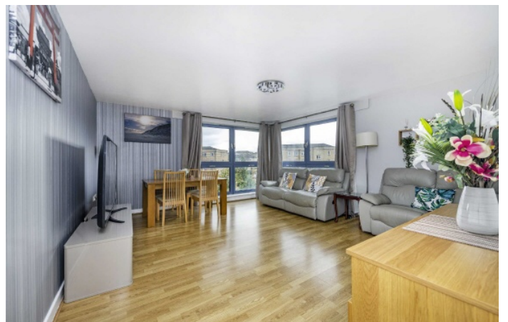
Sherwood Gardens, E14