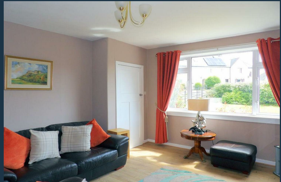
The photographs above show a spacious very comfortable lounge with open fireplace and a lovely bright kitchen with attractive dining area