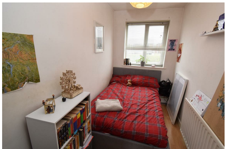
Bedroom 4 11'9" x 5'6" (3.59 x 1.68)

Fourth bedroom with laminate flooring, a radiator and a