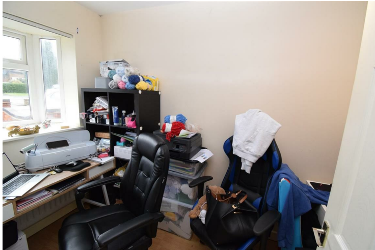
Study 9'8" x 5'6" (2.95 x 1.68)

With laminate flooring, a radiator and double glazed front bay window.