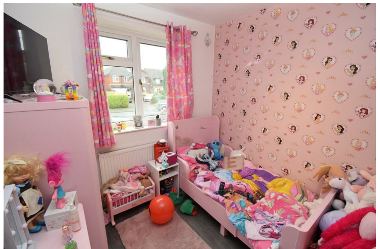
Bedroom 3 9'2" x 7'11" (2.80 x 2.43)

Third bedroom with laminate flooring, a radiator and a double glazed front window.