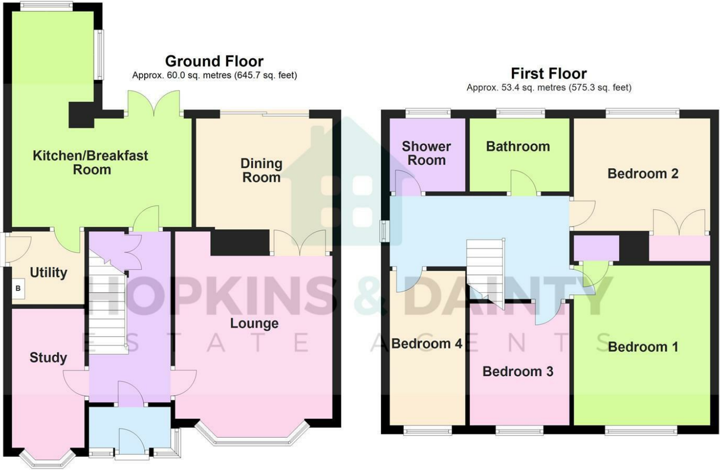
Total area: approx. 113.4 sq. metres (1221.0 sq. feet) Plan produced using PlanUp.