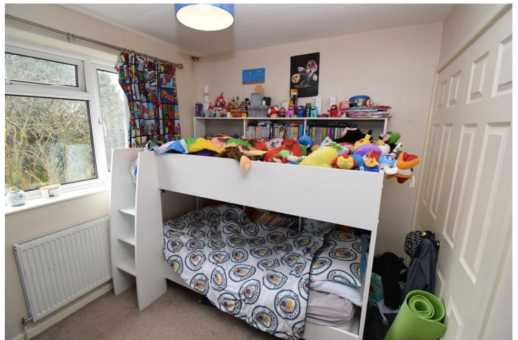
Bedroom 2 10'5" x 8'7" (+wardrobes) (3.19 x 2.63 (+wardrobes))

Rear double bedroom with a radiator, double glazed window and built in wardrobes.