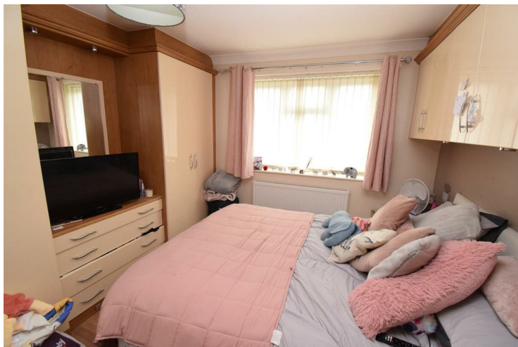
Bedroom 1 12'4" x 10'5" (3.77 x 3.18)

With a double glazed side window, radiator and access to the loft space. Doors leading off.