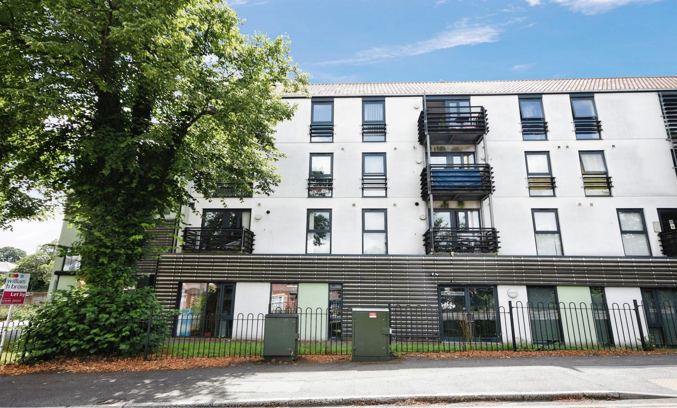
Upper Chase, Chelmsford CM2 0BN