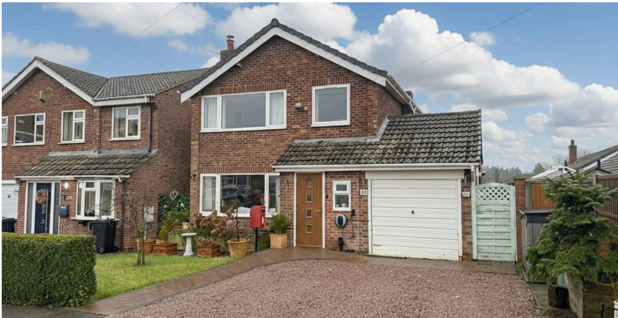
15 Burgin Close, Foston Grantham