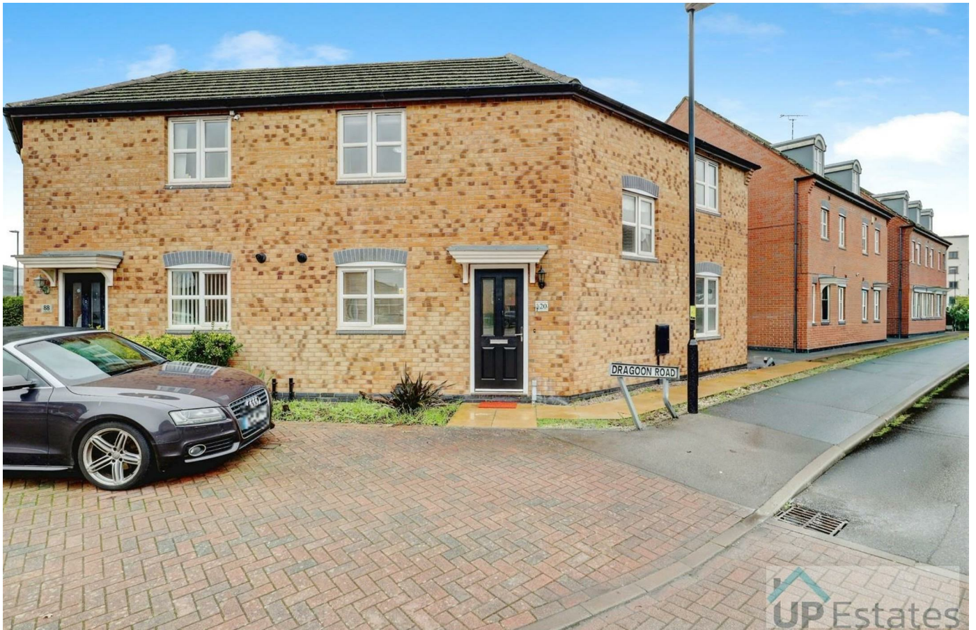
Dragoon Road, Coventry