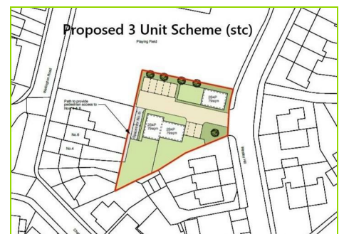
Wesley Hill Garage Site, Wesley Hill, Kingswood, Bristol, BS15 1TS