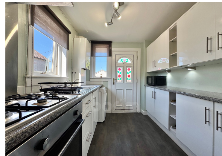
Larch Terrace, Beith