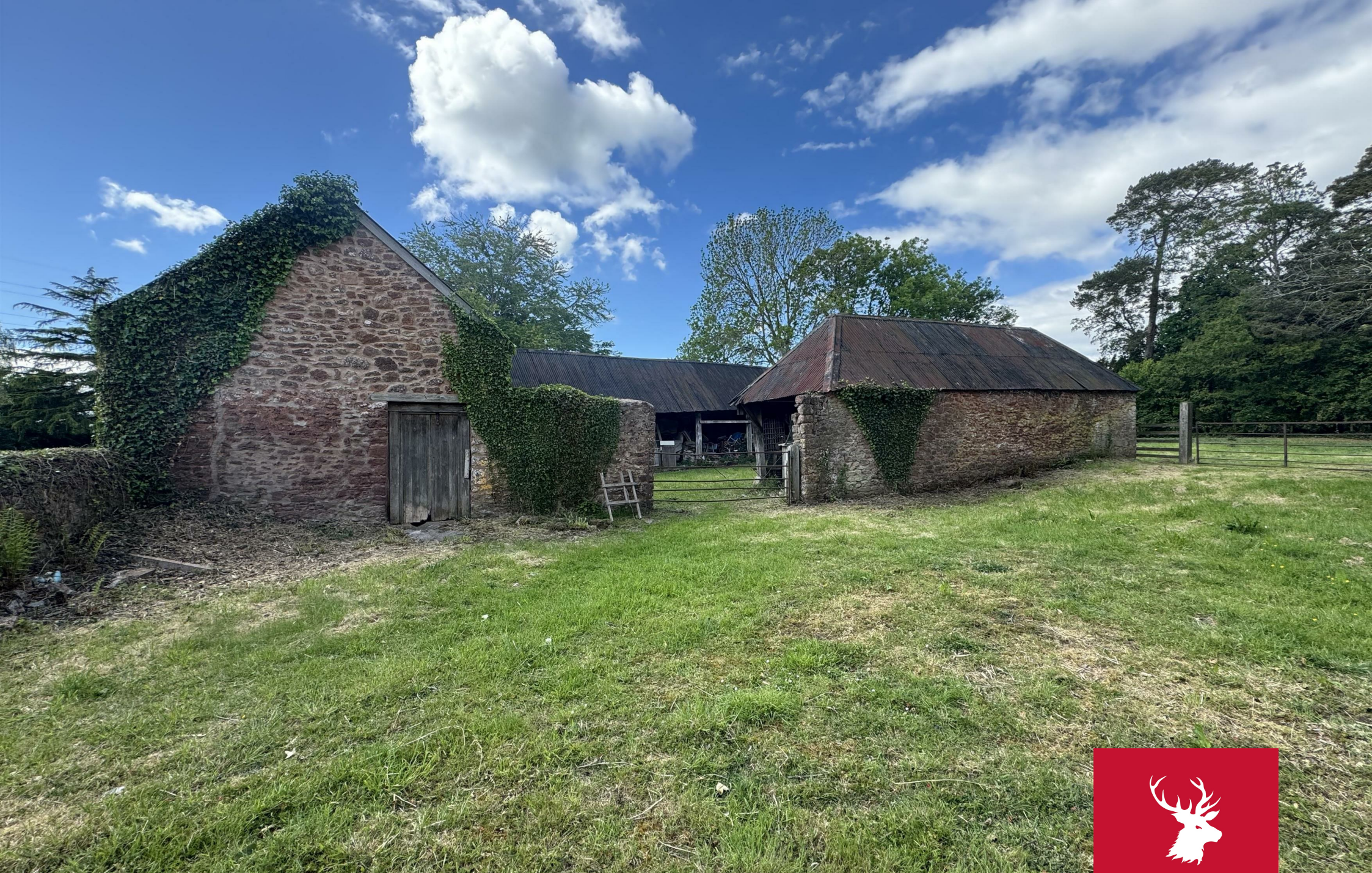
The South Barn