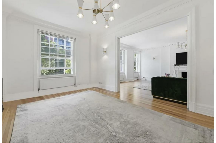
Abbey Lodge, Park Road, London, NW8 Approximate Gross Internal Floor Area = 213.5 sq m / 2299 sq ft