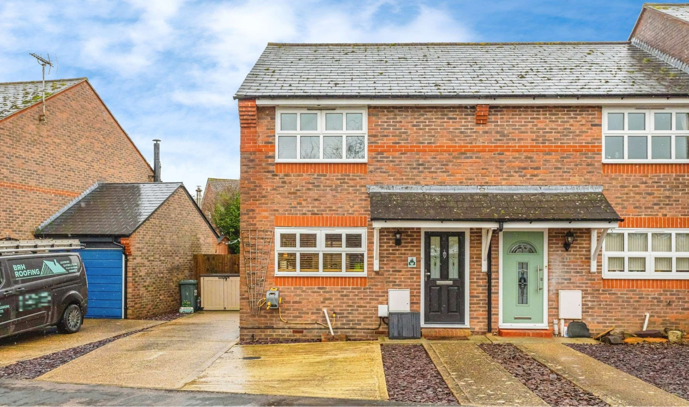
The Martlets, South Chailey, Lewes BN8 4QG