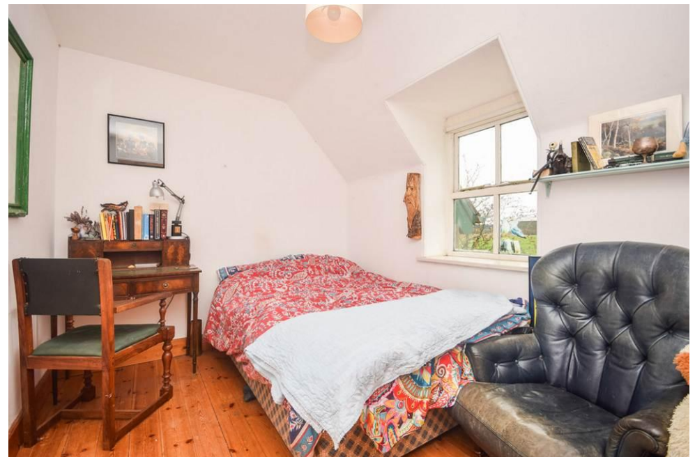
Next Home - Burnside of Drimmie Farn Cottage, Bridge Of Cally, Blairgowrie, PH10 7JT