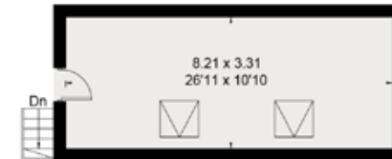
Outbuilding - First Floor