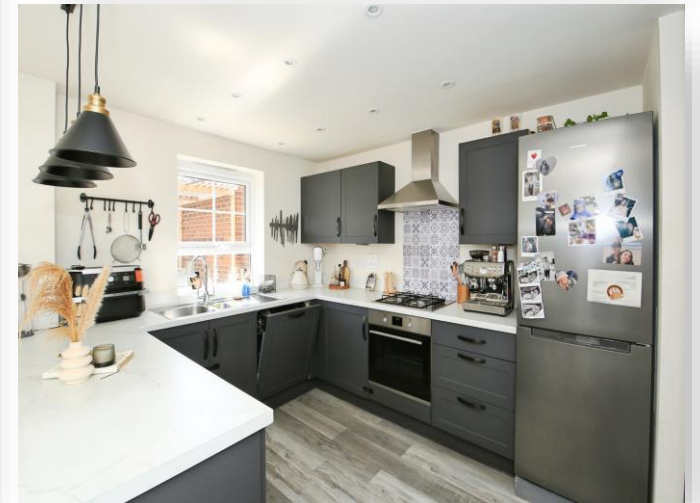
Almond Avenue, Whittlesey Peterborough PE7 2GT