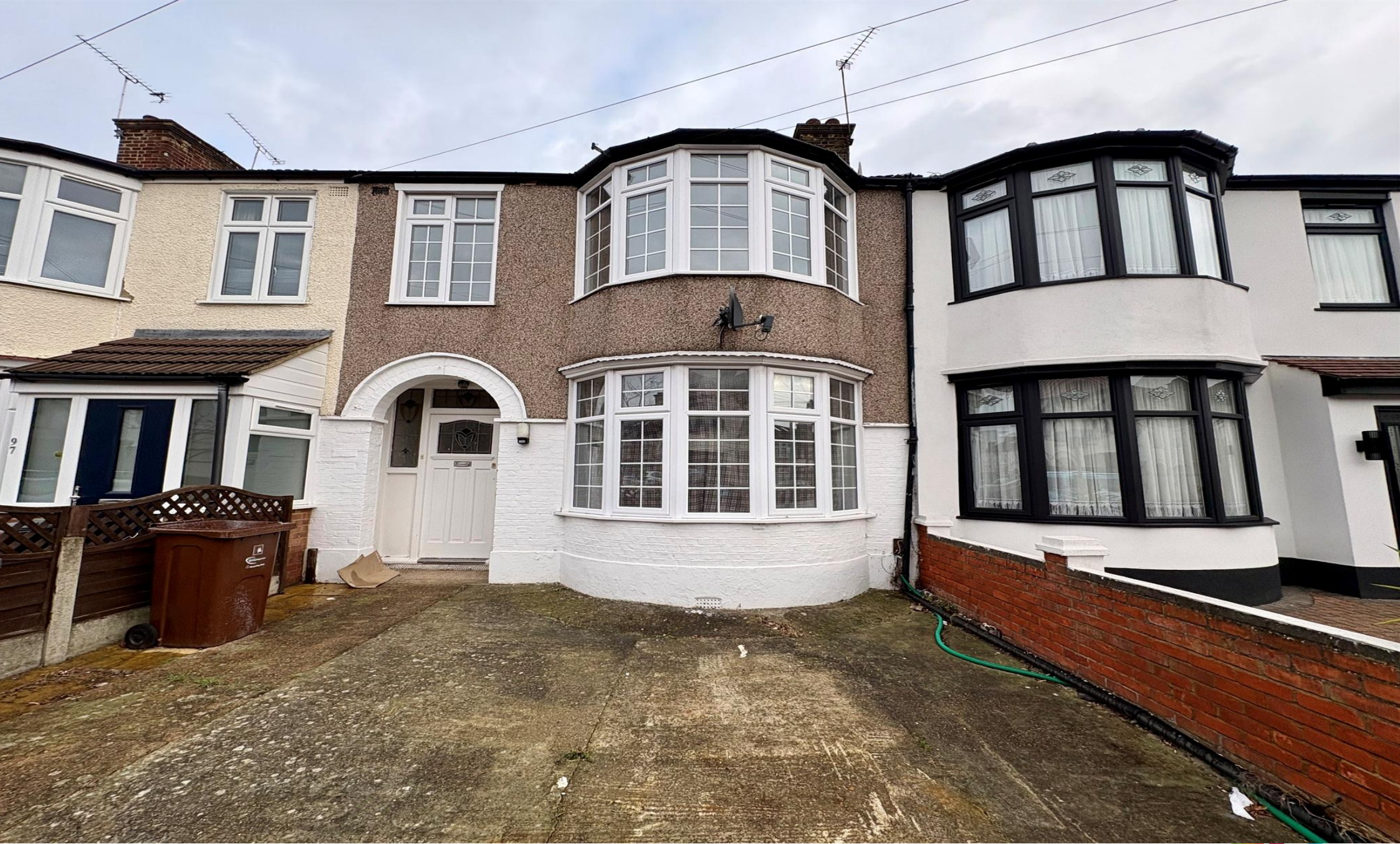
Shirley Gardens, Barking, IG11 9XB