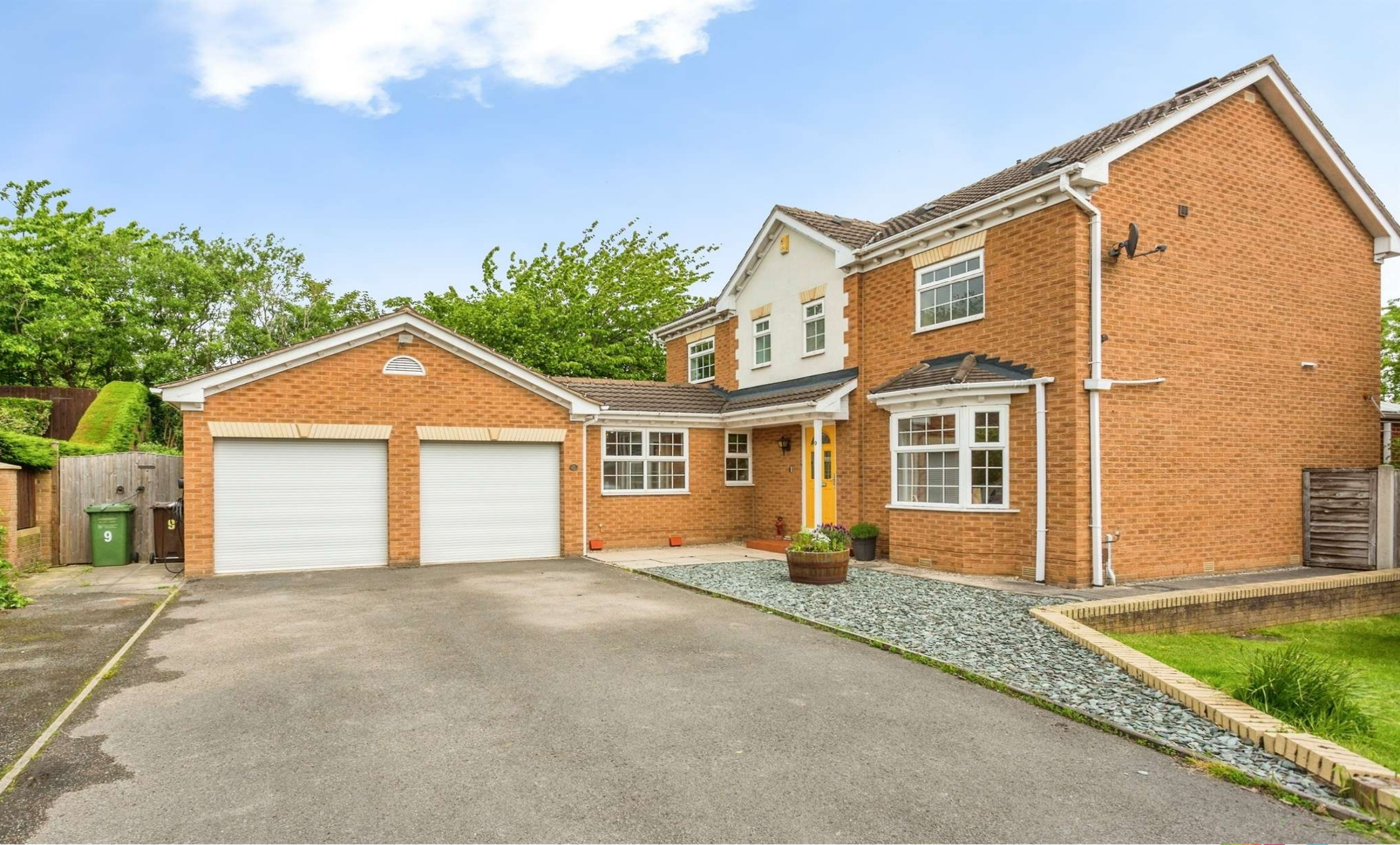
Lawns Court, Carr Gate Wakefield WF2 0UT