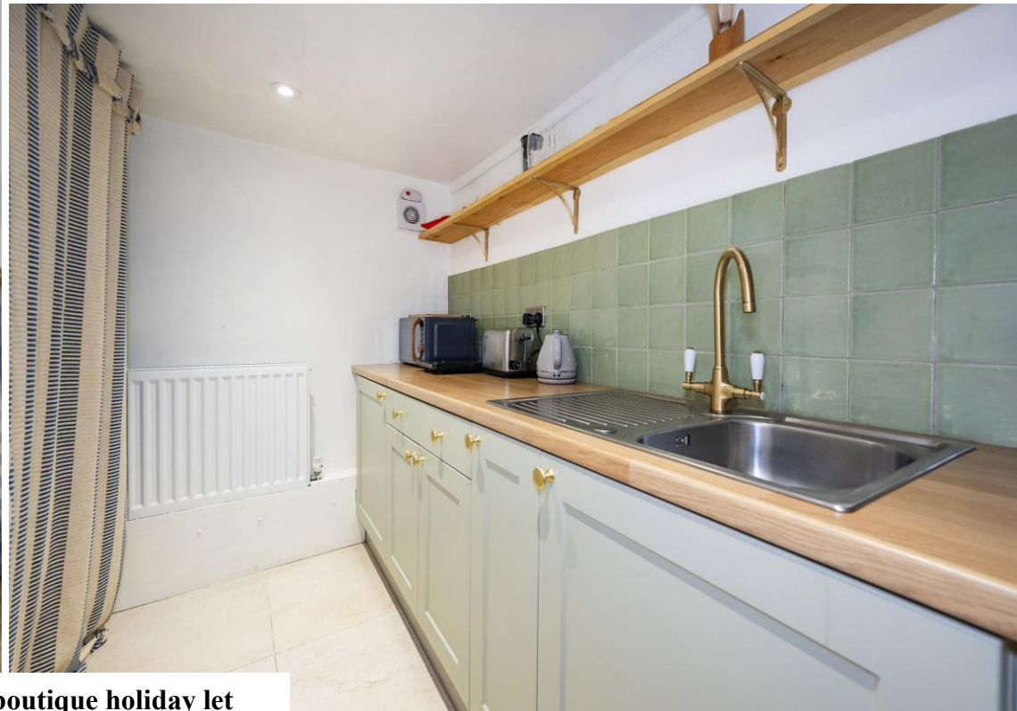
Willow Barn – a boutique holiday let forming one wing of the property