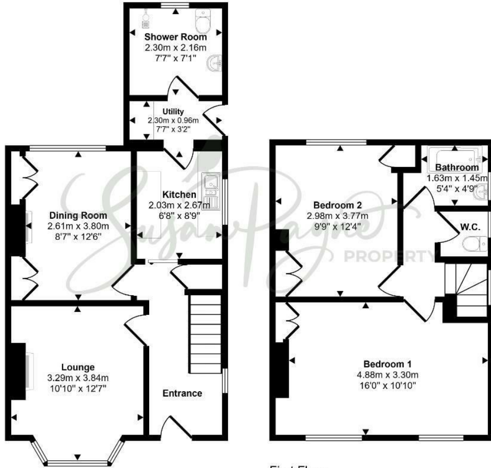
Ground Floor Approx 46 sq m / 500 sq ft

Approx Gross Internal Area 84 sq m / 901 sq ft