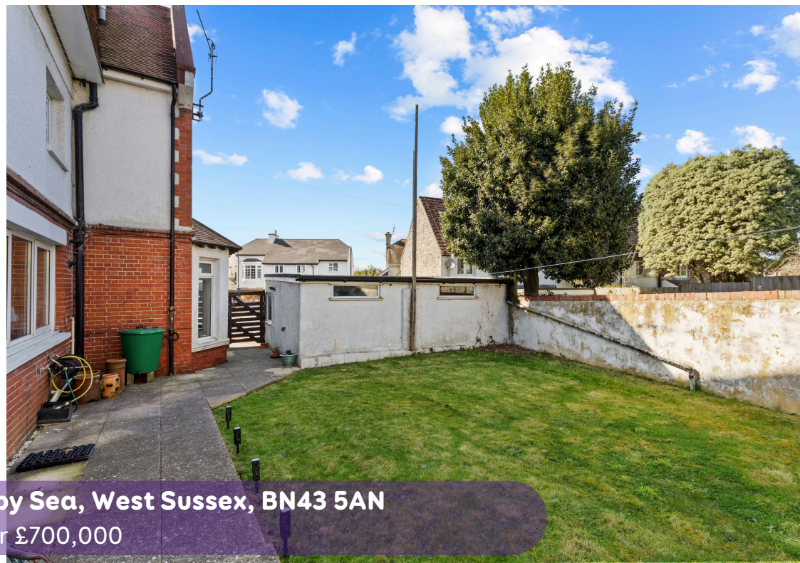
Southdown Road, Shoreham by Sea, West Sussex, BN43 5AN Offers Over £700,000