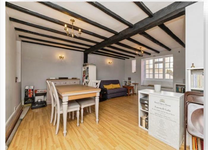
Town Wall, Hartlepool, TS24 0JQ