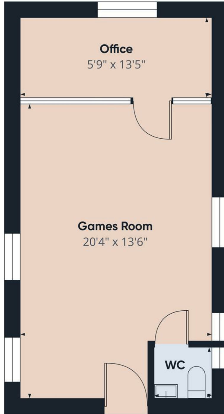
First Floor Building 2