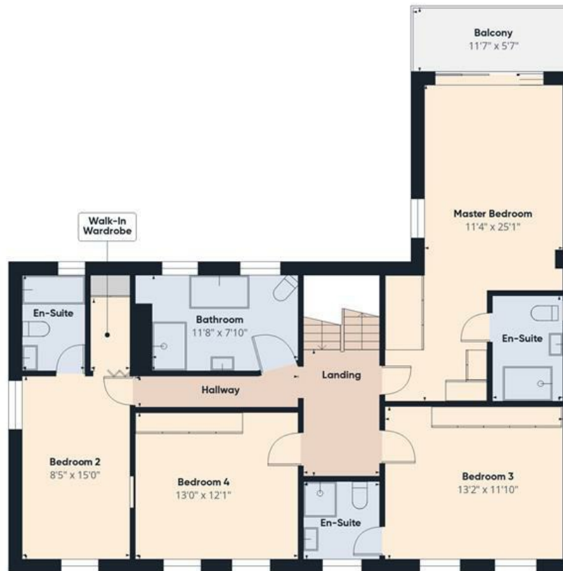
First Floor Building 1