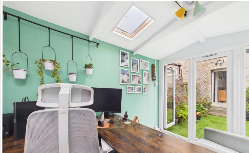
Garden Office Pod