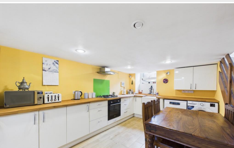
Kitchen / Dining