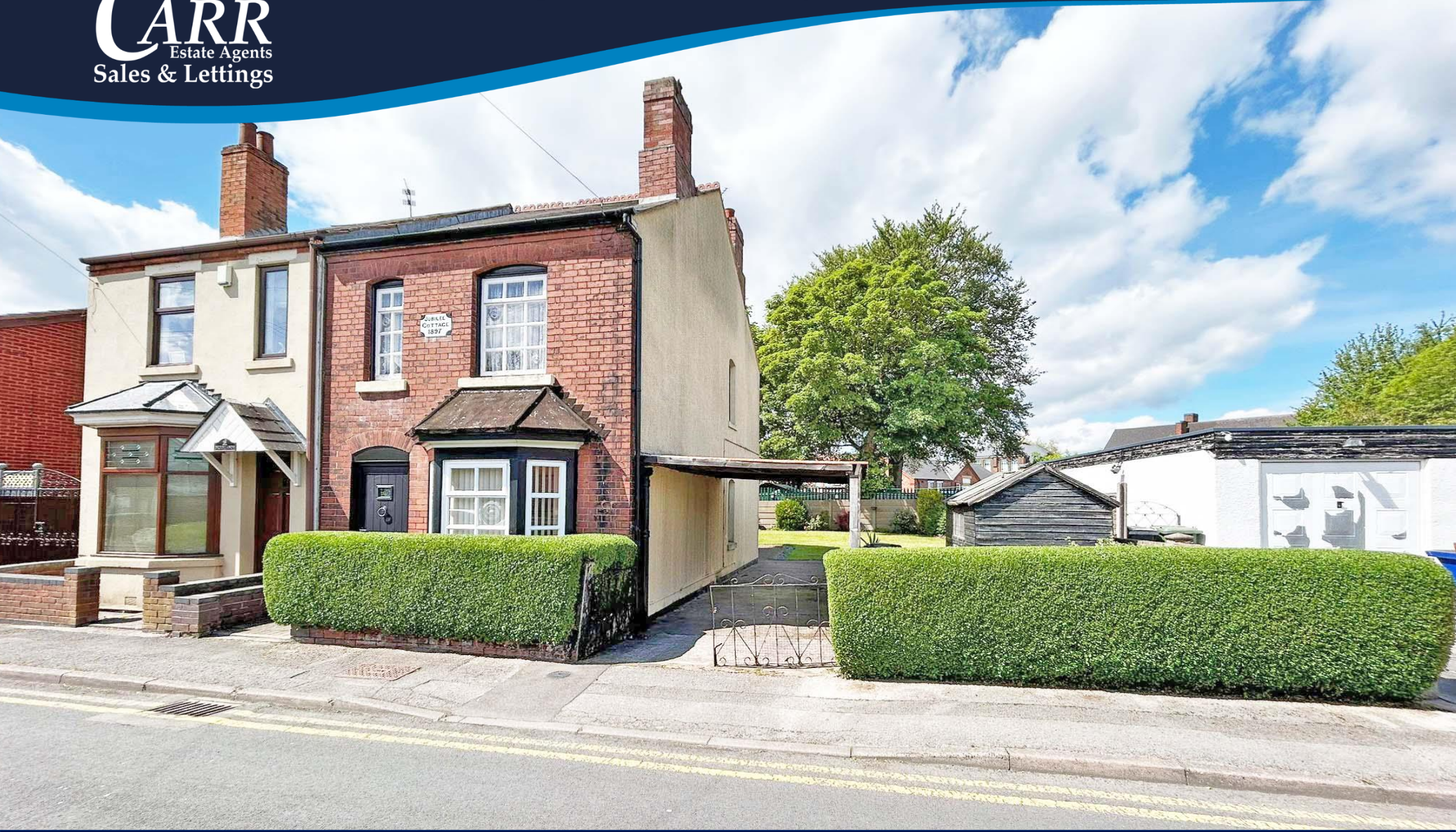
Jubilee Cottage, Orchard Road Willenhall, WV13 2EP