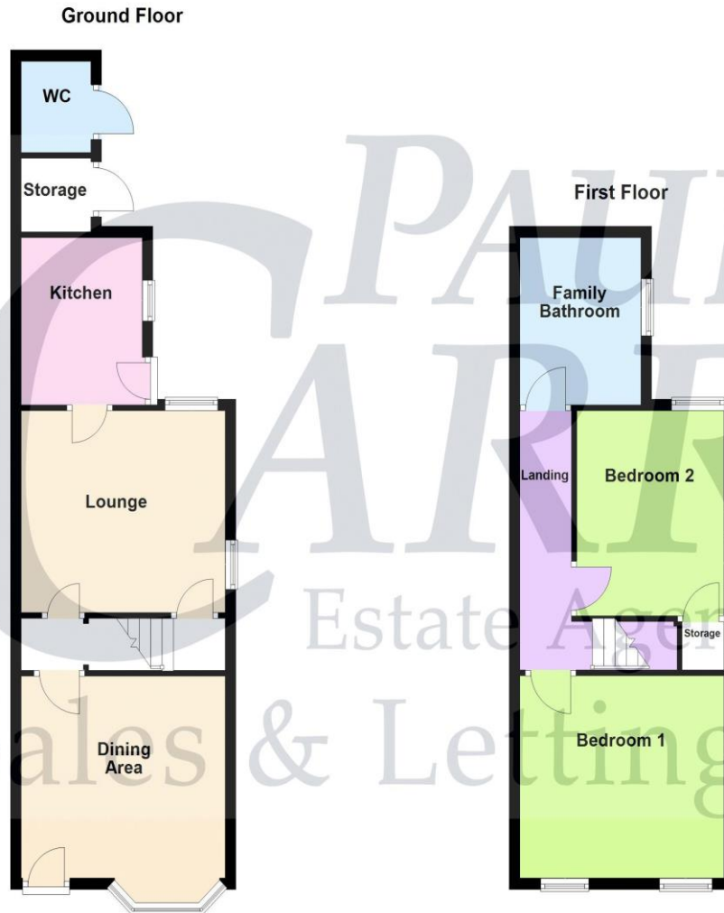
This floorplan is not drawn to scale and is for illustration purposes only Plan produced using PlanUp.

This floor plan is not drawn to scale and is for illustration purposes only