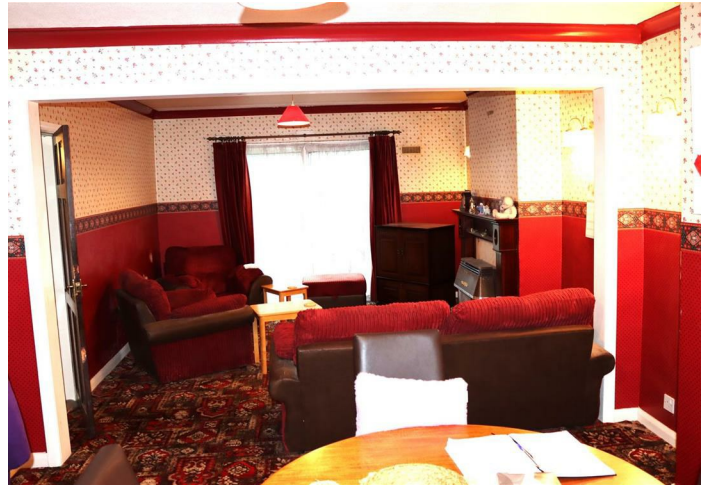
Through Lounge/Dining Room