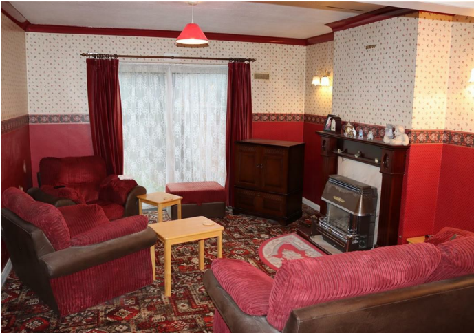
Through Lounge/Dining Room