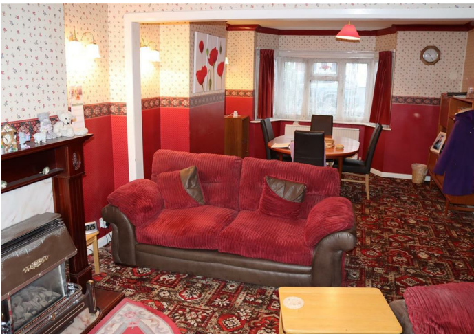
Through Lounge/Dining Room