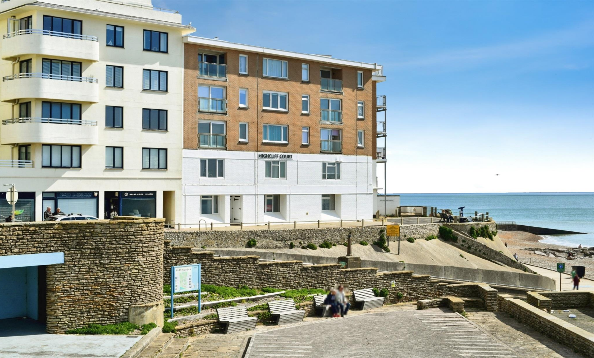
High Cliff Court High Street, Rottingdean Brighton BN2 7JP