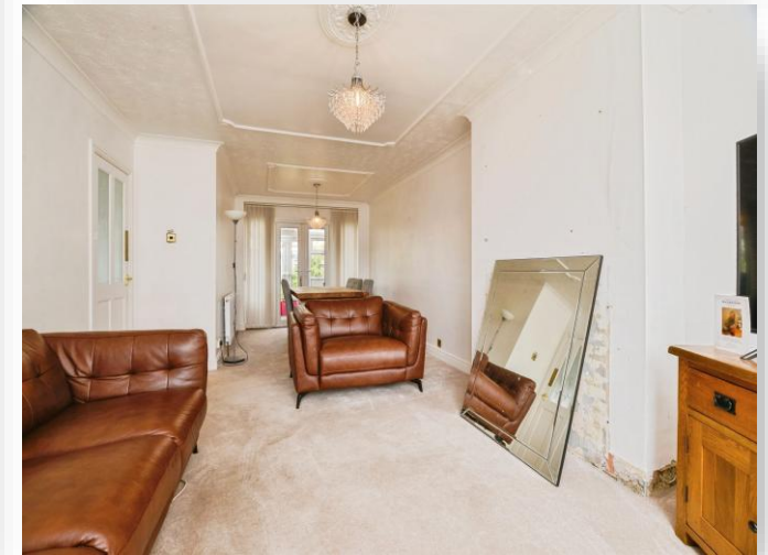
Burniston Drive, Thornaby Stockton-On-Tees TS17 0HB