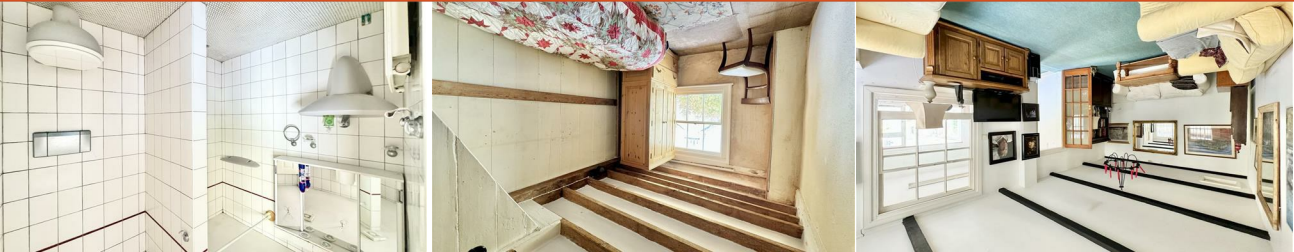
Sinnock Cottage Sinnock Square, Old Town,, Hastings, TN34 3HQ