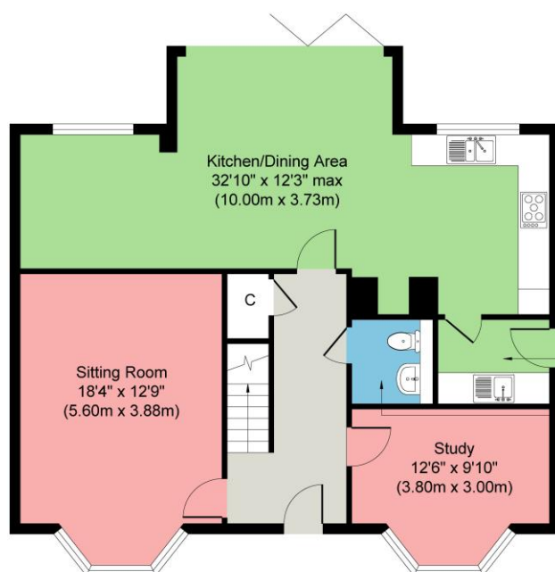
Ground Floor Approximate Floor Area 917 sq. ft (85.19 sq. m)