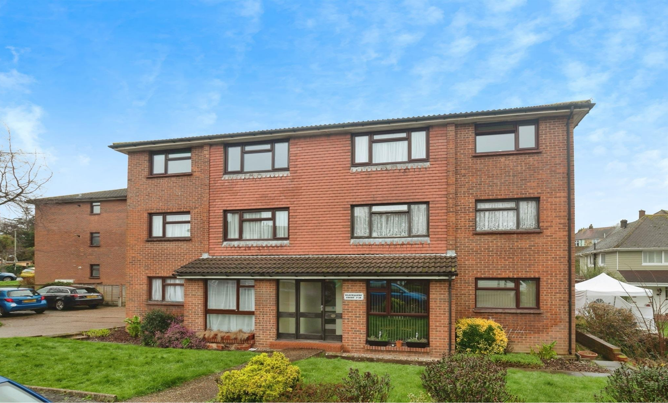
Blacklands Court - Fearon Road, Hastings TN34 2DL