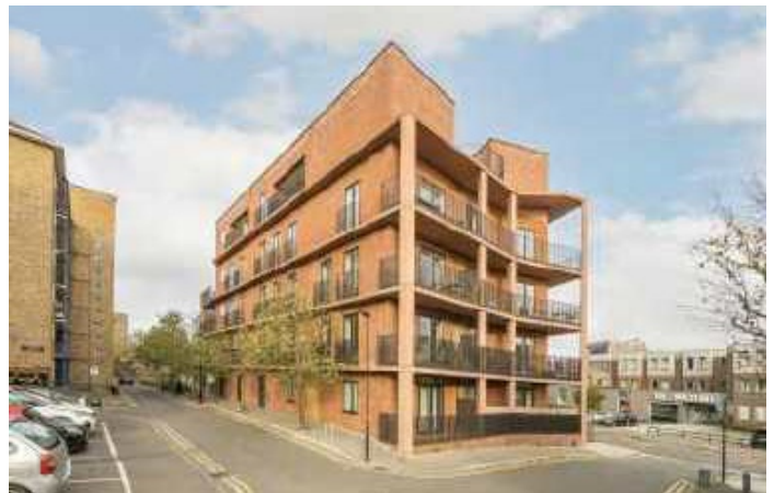
Loddiges Road, E9