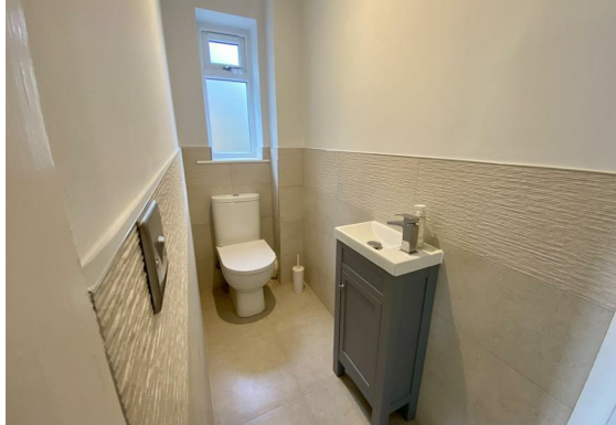
Ensuite 4'7 x 2'11 (1.40m x 0.89m)