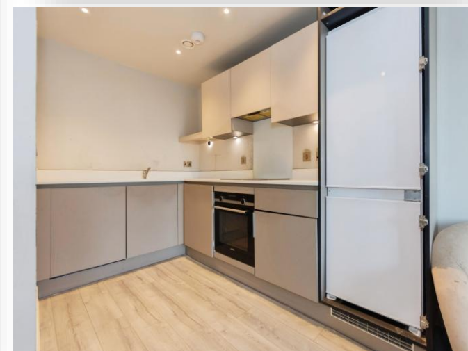
St Martins Place Broad Street, Birmingham B15 1EB