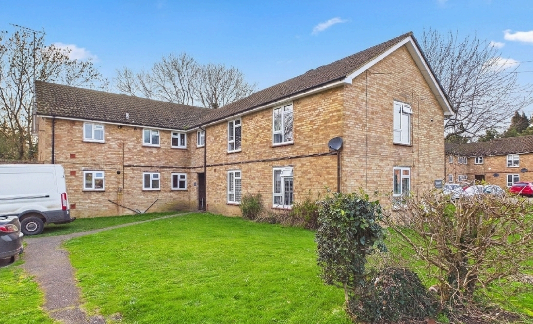
Downer Drive, Sarratt, Rickmansworth, WD3 6BD