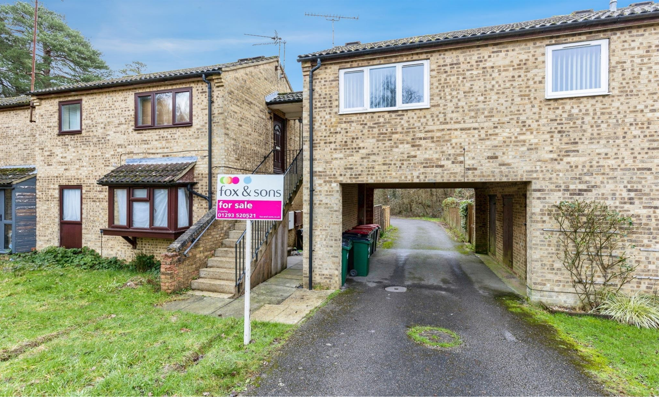
Brooklands Road, Crawley RH11 9QQ