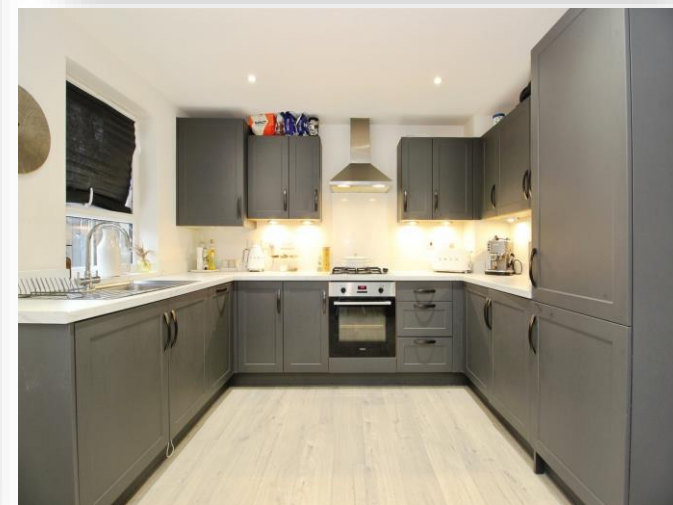
Reservoir View, East Ardsley Wakefield WF3 2GG