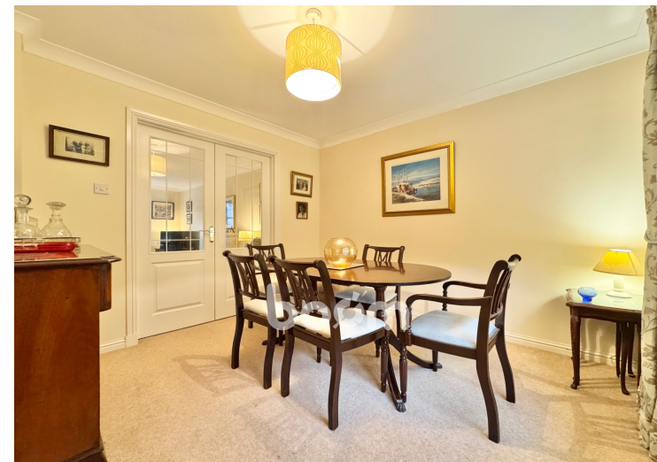
Grahamfield Place, Beith, Ayrshire, KA15