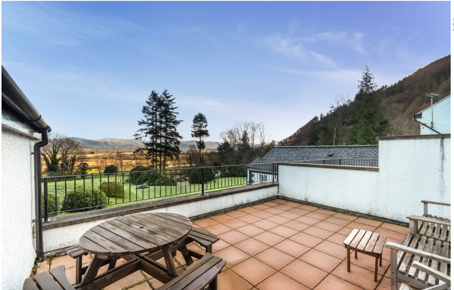
Balcony / Terrace

Request a Viewing Online or Call 01768 741741