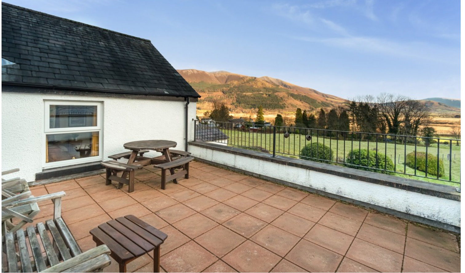
Balcony / Terrace