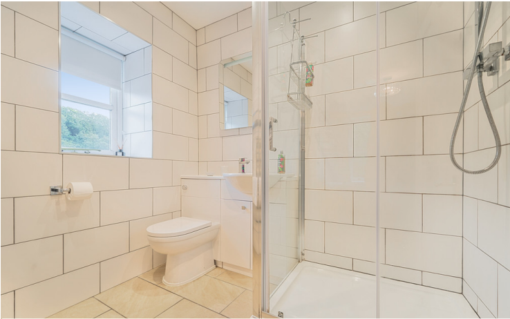
Bedroom One En-suite